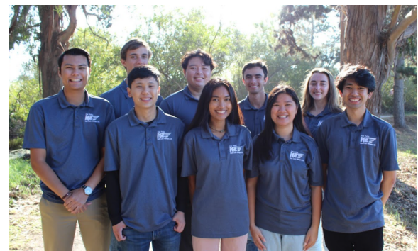
CPITE Officer Bonding at Butterfly Grove