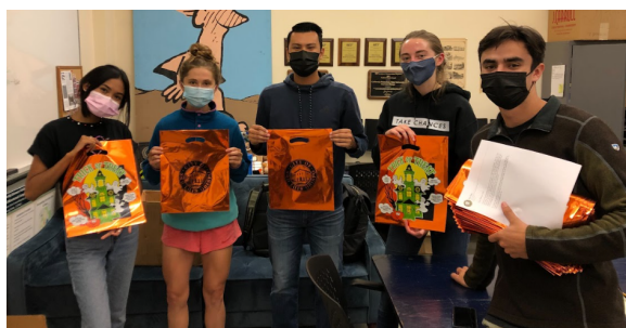
Halloween Bag Volunteering