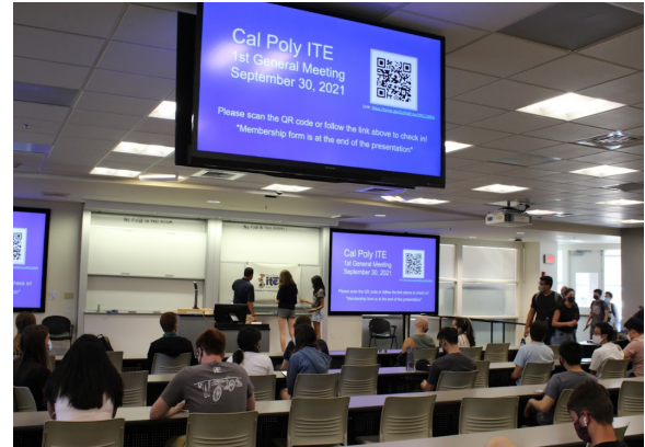
First General Meeting back in-person