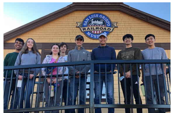
Railroad Museum Clean-up