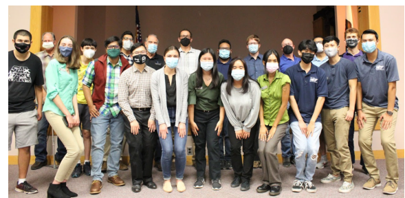
SLO Transportation Mixer