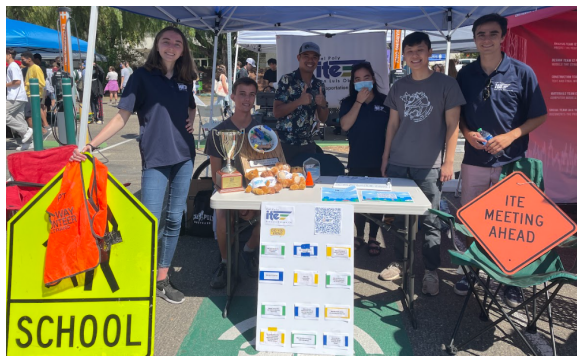
ITE Booth at Club Showcase