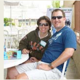
July Summer Social