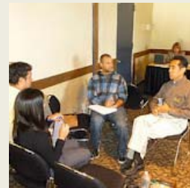
September Luncheon at SDSU