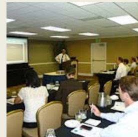
October Workshop and Luncheon with WTS