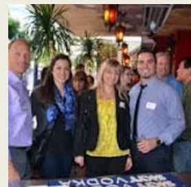
April Business Mixer