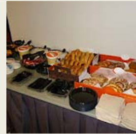
September Workshop with Walk San Diego