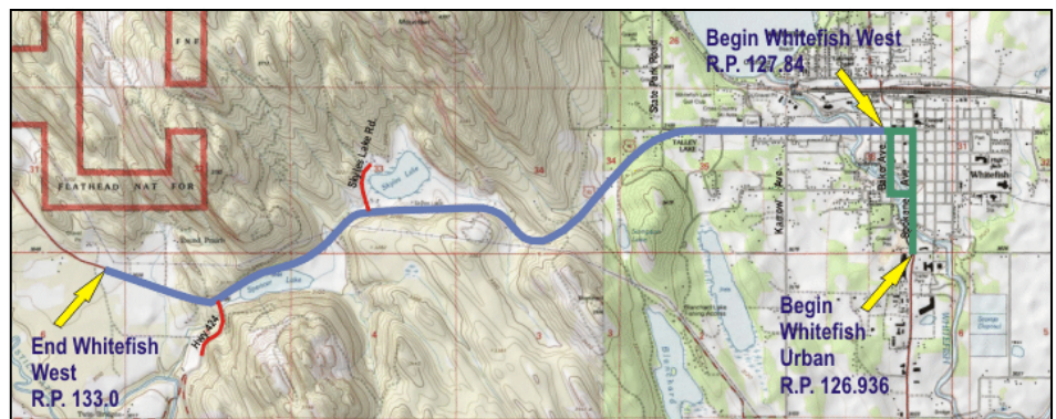
The U.S. 93 improvement project will extend west from downtown Whitefish.