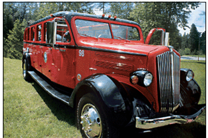
A Red Jammer bus.