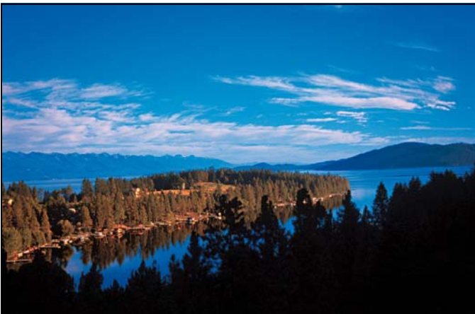
Take a boat cruise on beautiful Flathead Lake after Sunday evening's Get Acquainted social.

The Kalispell Meeting will feature a guided tour of the Going-to-the-Sun Road, one of the most picturesque engineering marvels in North America. The spectacular Flathead Mountain Range, which decorates Glacier National Park, is Montana's answer to the Swiss Alps, both in sheer beauty and spectacular views. Guided travel will be in the historic Red Jammer buses, vintage 17-seat sedans. Not