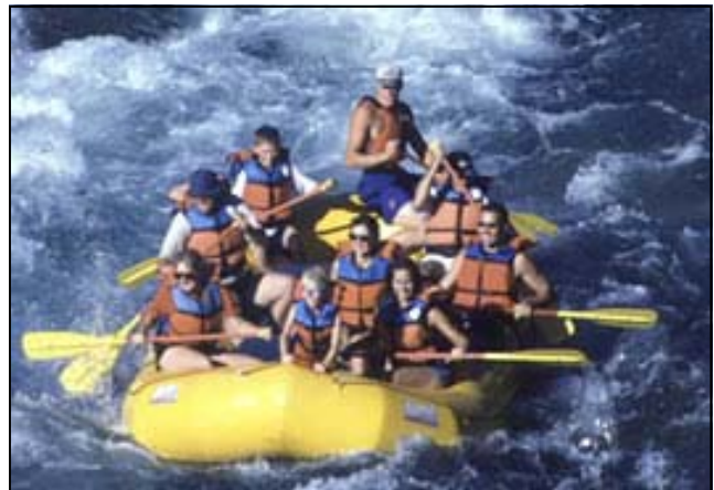
Never tried river rafting? Now's your chance! A rafting excursion will be available.