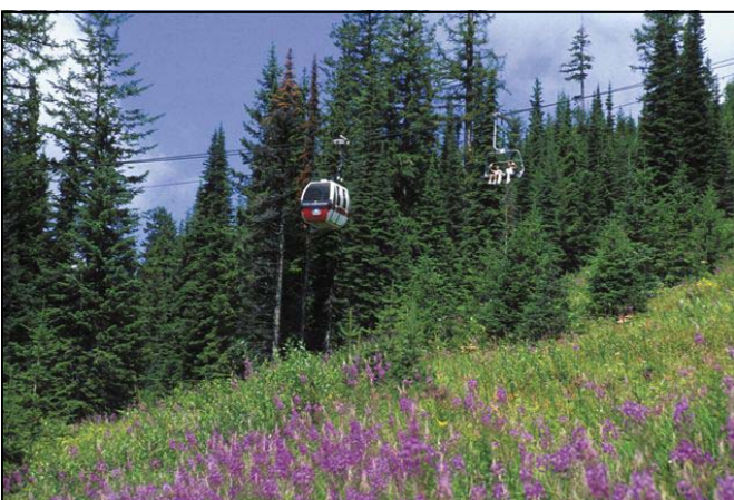
These gondolas will transport you Monday evening’s Family Night activity at the summit of Big Mountain Resort.

The Meeting will feature a golf tournament at Buffalo Hill Golf Club, the most popular golf course in the Flathead Valley. Proceeds from this year’s tournament will go toward District 6 Student Initiatives, to help support the next generation of ITE members. Attendees may also want to take some time to play one of the other eight championship courses in the Flathead Valley, each of which offers forest-lined fairways and challenging terrain created by world-renowned golf course architects. The Flathead Valley was named one of the “50 Greatest Golf Destinations” by Golf Digest, January 2003.