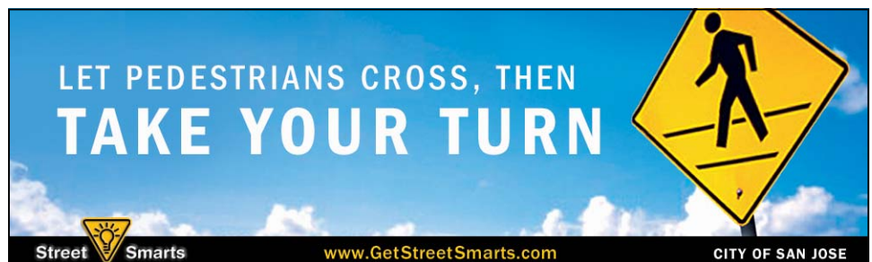
Sample billboard from the Street Smarts program.