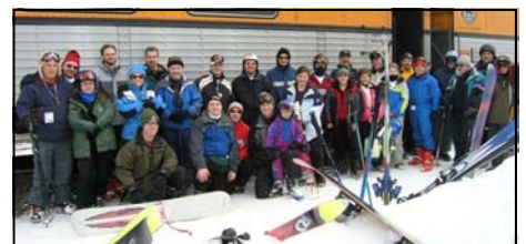
Thirty-seven members of the Colorado-Wyoming Section participated in this year’s Snow Train outing.