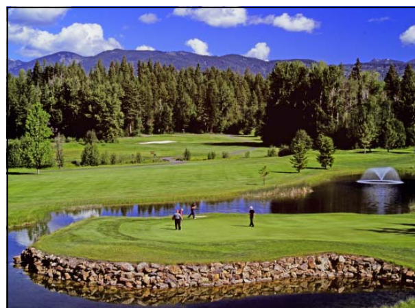
Don’t miss the Sunday golf tournament or you’ll miss views like this.

Experience everything this spectacular destination has to offer when you come to the 2005 District 6 Annual Meeting in Kalispell, Montana.