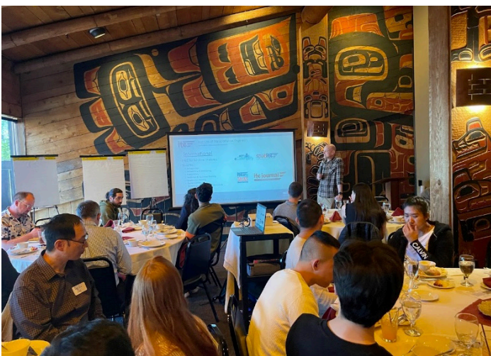
May Student Night at Ivar's Salmon House

ITE WA also hosted two social events this spring: a virtual transportation trivia night and annual golf tournament. This trivia night is a fun social event that was hosted virtually although several teams met up together in-person to participate. The golf classic was held at Snohomish Golf Course and was a fun day of networking and golf had beautiful weather and brought together both new and seasoned players.