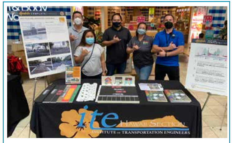
Hawaii Engineers Week Public Outreach Event