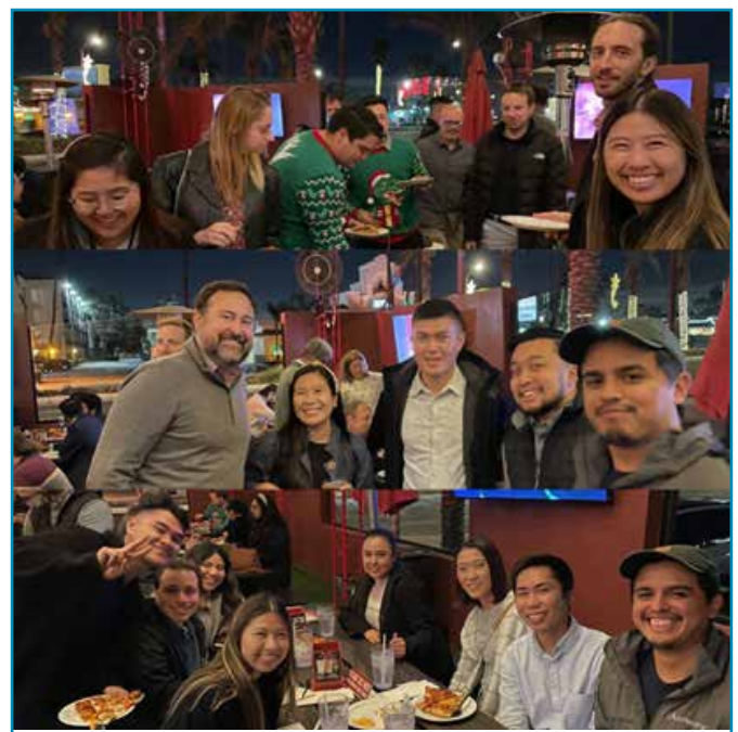
SoCal Holiday Mixer Collage

In December, ITE So Cal hosted an in-person Holiday Mixer in collaboration with OCTEC and ITS CA at Rock 'N' Brews in Buena Park. The event was well attended and well received by the group. Everybody was happy to get together in person and share the holiday spirit!