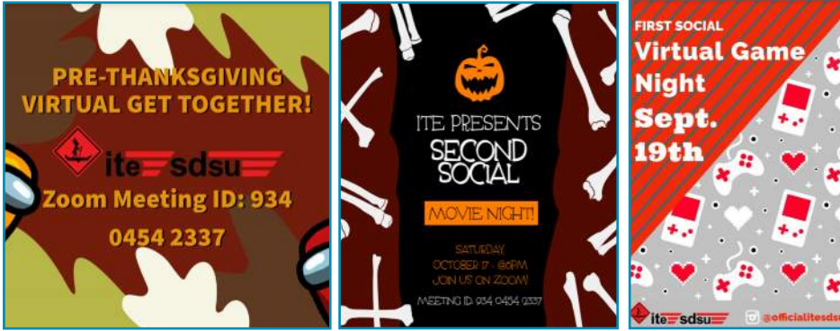
San Diego Student's were active, despite COVID!