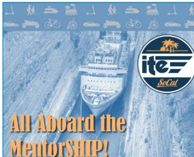
ITE SoCal MentorSHIP Program

The pandemic also didn’t stop us from organizing our annual conferences. In January, we held our annul Safety Training and Conference and featured topics including video safety analytics, speed limit setting, application of traffic control devices for bikes and peds, and pedestrian lighting. In February we held our annual joint conference with the northwest section of the IMSA. This conference featured speakers on topics like parking demand management, ITS, new trends in transportation, connected vehicles, and cyber security. This conference also featured a series of four breakout sessions where attendees could choose between six different vendor presentations and learn about new products.