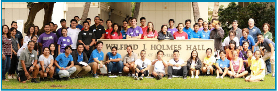
Hawaii Section STEM activity participants, November 2019.