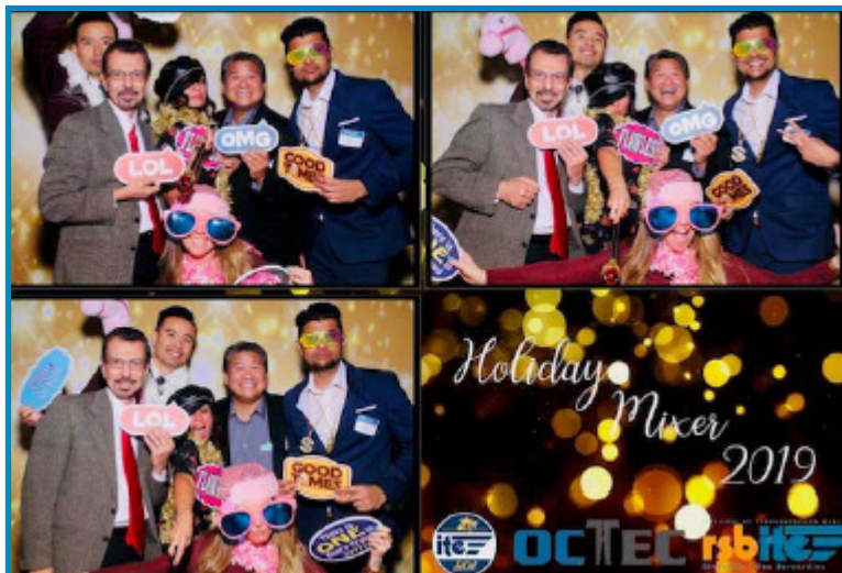
Joint Holiday Mixer: Riverside San Bernardino Section, Southern California Section, and OCTEC.