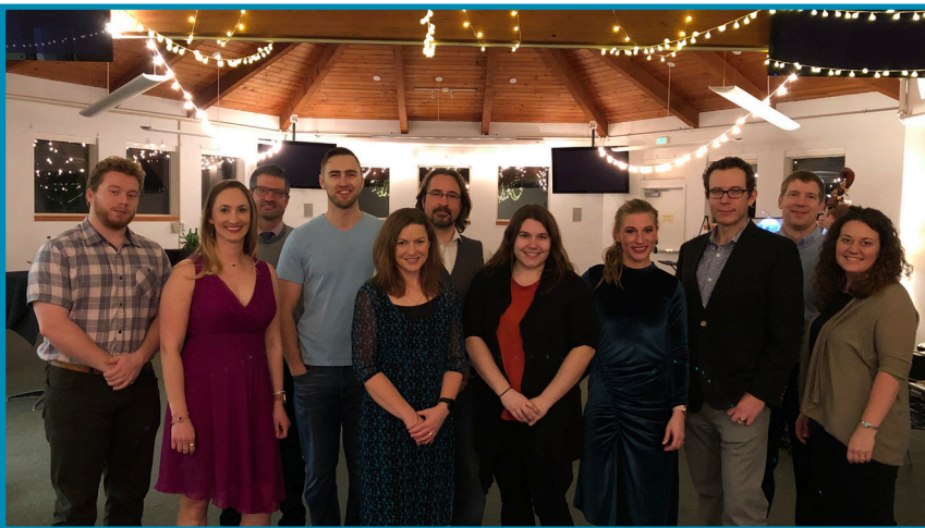
The hard working volunteers for the Alaska Section Annual Scholarship Fundraiser Beer & Wine Tasting Silent Auction.