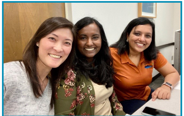
What a great SoCal Student Traffic Bowl Judging Panel! Congratulations to UCLA on their win!