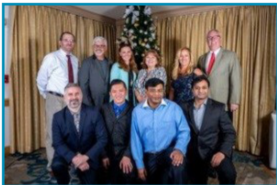
San Diego Section Holiday event

December 15, 2019: The holiday event was in beautiful surroundings at the ballroom in the Hilton Harbor Island hotel. Raffle prizes were given out throughout the evening intermixed