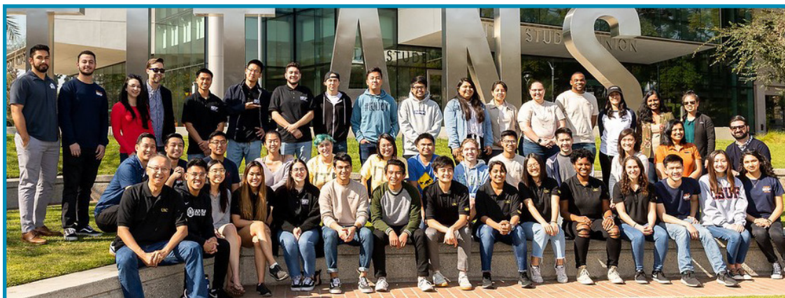
2020 Southern California ITE Student Traffic Bowl

The ITE SoCal Student Traffic Bowl was held at Cal State University Fullerton in February. The Traffic Bowl included six student chapters: USC, UCLA, UC Irvine, CSU Long Beach, Cal Poly Pomona, and CSU Fullerton. After an intense first round, UCLA, Cal Poly Pomona, and UCI moved to the final round. UCLA emerged as the victor. Congratulations to the UCLA!