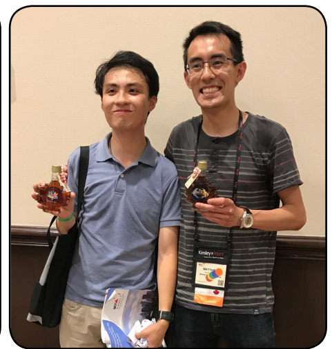
Winning Student Team from Toronto