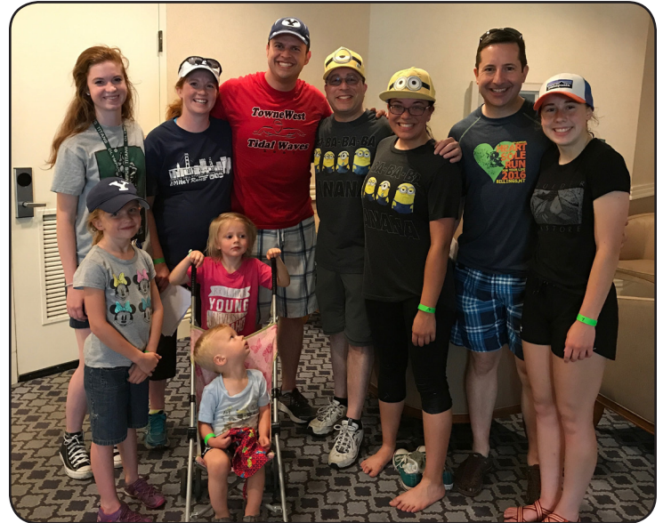
Winning Family/Friends teams (San Diego), from L to R: 5.75 Moore, MiteY Minions, Mighty Montanans