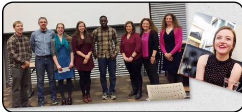
The Alaska Section Board and Scholarship Winners

Funding is made possible by the successful Beer, Wine, and Cider Tasting and Silent Auction event held each fall.