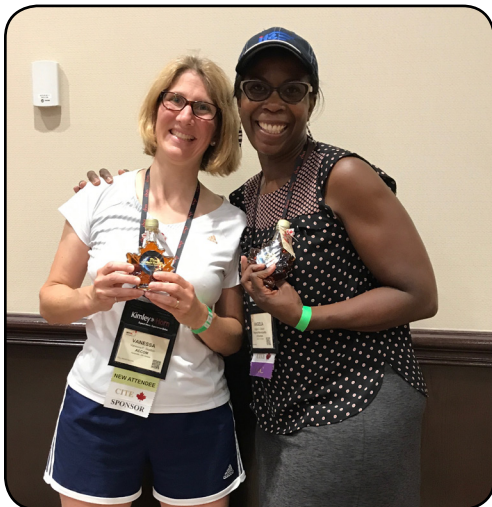
Winning Family & Friends team from Toronto