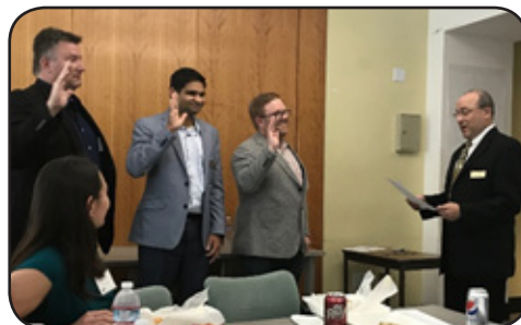
Swearing in this year’s officers