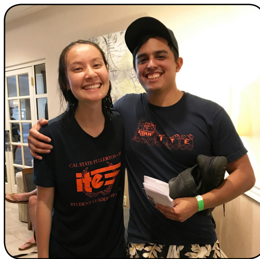
Winning Student Team (San Diego) from Cal State Fullerton