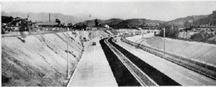
The same spot after construction, looking north from Avenue 26 Bridge.

the parkway. The first segment was opened on January 4, 1939 and the entire segment of the original Arroyo Seco Parkway was completed on December 30, 1940, just in time for Tournament of Roses crowds. It was hailed as the first freeway in the West.