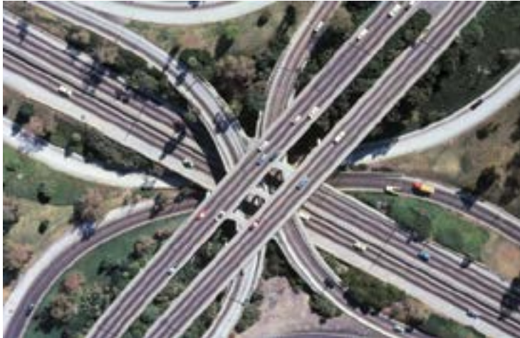
The Four Level Interchange, the first full-freeway interchange, circa 1951

The work began in stages and was undertaken by both the City and the State Division of Highways (now Caltrans). The City designed and managed the construction of the flood control channel and designed the freeway lighting, while the Division of Highways managed the construction of