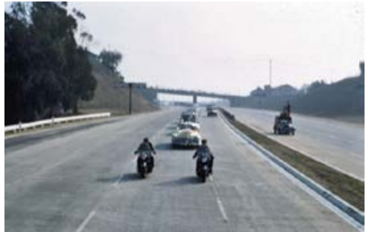
Opening of the first segment of the Hollywood Freeway, 1950