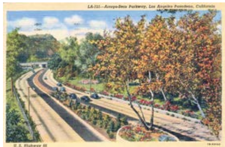
Postcard of Arroyo Seco Parkway near York Boulevard

A roadway was envisioned along the Arroyo Seco as early as 1895, although motor vehicles were not envisioned yet. In 1924, the Major Street Traffic Plan proposed a parkway and the concept was approved by voters that same year. During the next few years, the Avenue 26, Avenue 43 and Avenue 60 decorative bridges were designed and built by the City to span the riverbed and a future 80-foot divided highway. However, delays ensued, and the roadway remained no more than a plan, due to the lack of funds during the Great Depression and controversies regarding the building of a roadway through park land.