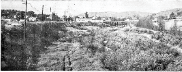
Before the Parkway came, cottonwoods filled the Arroyo Seco.