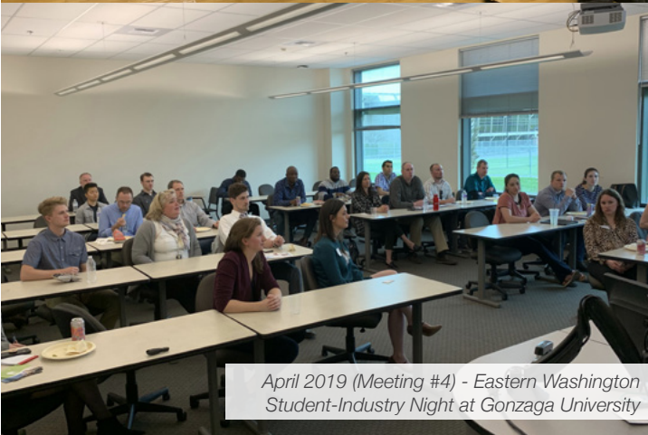
April 2019 (Meeting #4) - Eastern Washington Student-Industry Night at Gonzaga University