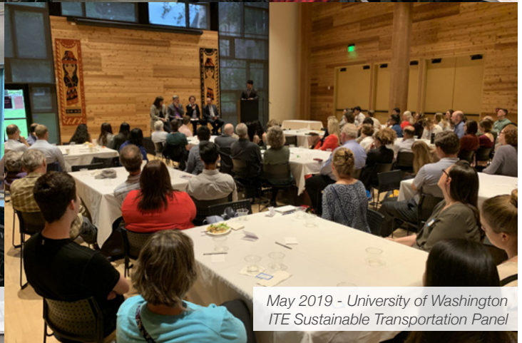
May 2019 - University of Washington ITE Sustainable Transportation Panel