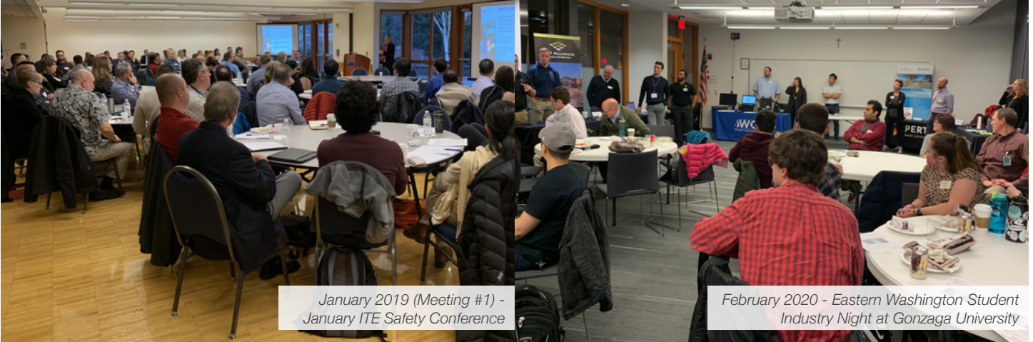
January 2019 (Meeting #1) - January ITE Safety Conference